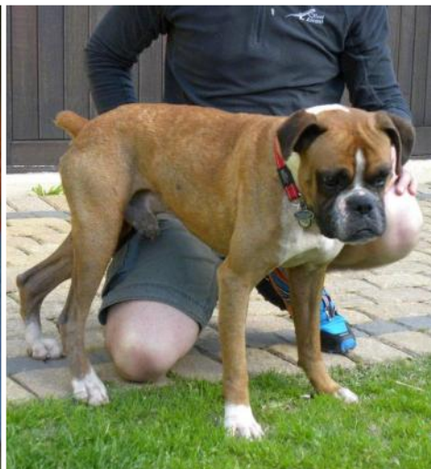
September 1: One week at home.