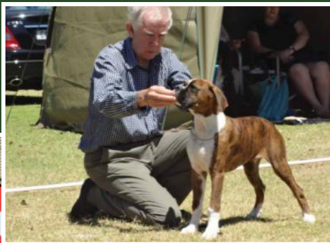
Dawkendale Dream Lover