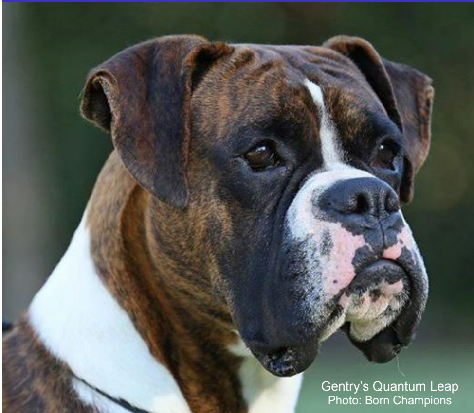
Gentry's Quantum Leap