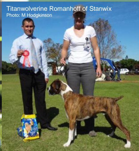
Titanwolverine Romanhoff of Stanwix